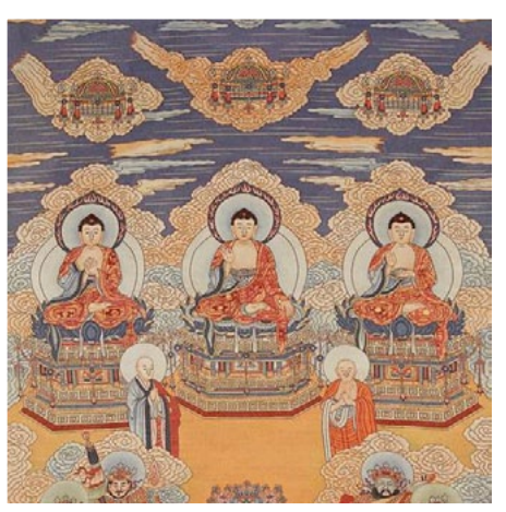
There are many subtleties that distiguish the original Buddha from the Dhyani Buddhas, as seen in this Tibetan Thangka; PRIMITIVE ID# T1105-010

Last night I dreamt the grass was soft against the soles of my bare feet. The air was warm and birds fluttered and sang from their perches in the lush trees. Fish darted beneath the surface of a pond. I walked over the grass where no path marked the ground; yet I knew where to go. I reached out and parted the branches of a bush and saw a man sitting beneath an ancient fig tree. He sat so still I wondered if he was actually a statue; but as I approached, his eyes opened and without saying a word, he welcomed me. Instinctively, I knew it was Buddha. The enormity of sitting down before him hit me in my waking state; but in my dream there was no panic to be felt, no decisions to be made - everything just flowed. I sifted through many questions and asked only one: "What qualities must we have to become like you, to become a Buddha?" The figure in my dream looked over my shoulder and pointed; and I turned to see five more figures. "Become like them,"