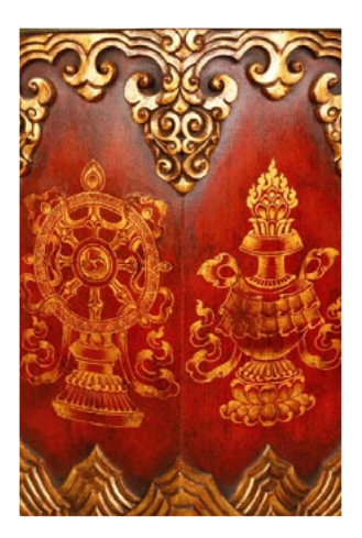
Detail of dharma wheel on antique Nepalese pagoda-form prayer wheel; PRIMITIVE ID# A0901-055

regard, he represents transcendent wisdom. His symbol is the dharma wheel, the Wheel of the Law that represents Buddha's teachings.