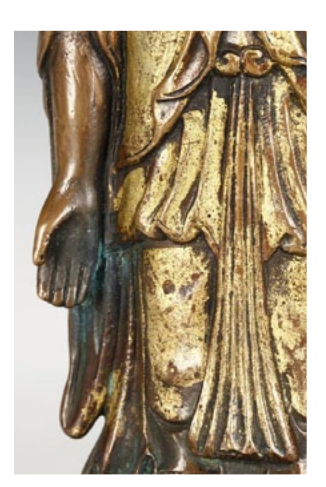
Riverstone statue of Dhyani Buddha Ratnasambhava; PRIMITIVE ID# A1406-085

Ratnasambhava is sometimes called the 'Origin of Jewels' and is depicted being adorned in lavish gems, or holding a jewel. These attributes do not symbolize an attachment to worldly wealth, but rather the capacity to enrich the lives of people