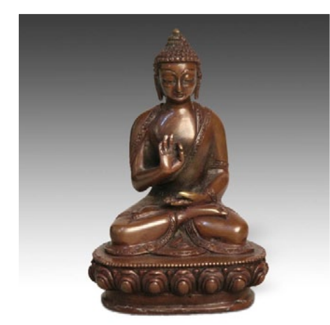
Seated figure of Buddha with Abhaya Mudra; PRIMITIVE ID# A0607-432

4) In the northern position is Amoghasiddhi , who symbolizes energy and accomplishment. His name literally means infallible success and he embodies the fourth skandha, mental formations, which include all mental states both virtuous and non-virtuous, habits prejudices and predispositions. Arguably, it is these mental states that lead to actions resulting in karma. Amogasiddhi is known for his fearlessness – especially of evils such as envy and bitterness – and this is reflected in his mudra called Abhaya . In fact, abhaya in Sanskrit means fearlessness. This mudra symbolizes protection and peace in addition to the dispelling of fear. The mudra is made by holding the right hand out, palm facing outward, fingers upright. It looks like the western gesture to stop; but it is meant to be a pacifying gesture implying fearlessness before any potential enemy; and is known as the 'fear not' gesture.