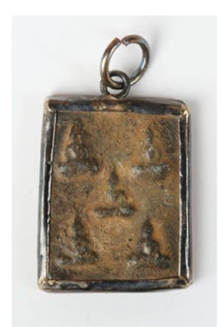
Clay and brass pendant depicting the 5 Dhyani Buddhas; PRIMITIVE ID# J1400-157

said the Buddha, voicing words for the first time. I looked closely. Each figure looked alike at first blush, but upon closer examination was slightly different with their own appearance and personality.